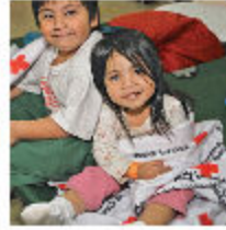
Warm blankets and much more

In this season of hope, give gifts that save the day