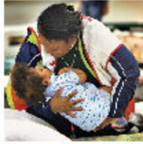
Emergency food and shelter