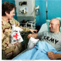
Give a military comfort kit

We are sorry for the inconvenience, but our online classes are unavailable until November 8 – check website for schedule after the 8 th . Skills review classes available upon appointment.